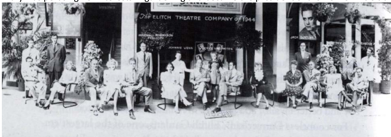
The 1944 Theatre staff