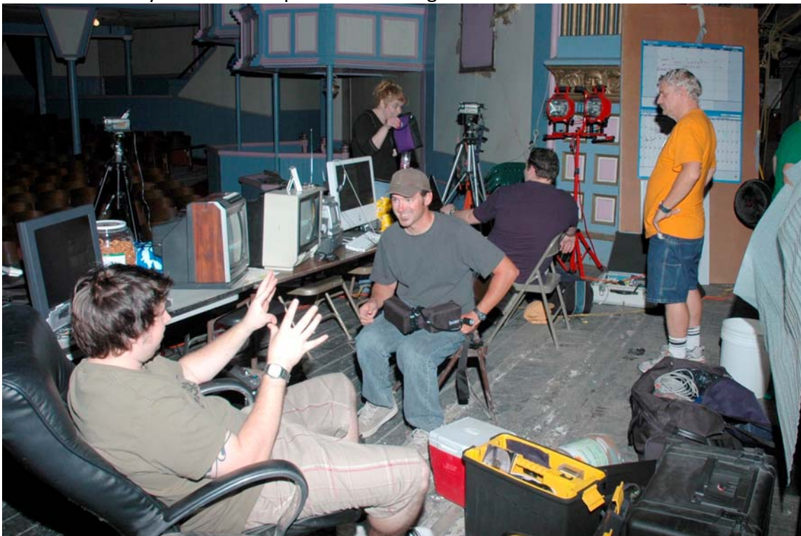
The base location during the investigation

We scheduled hourly EMF and temperature readings at each location