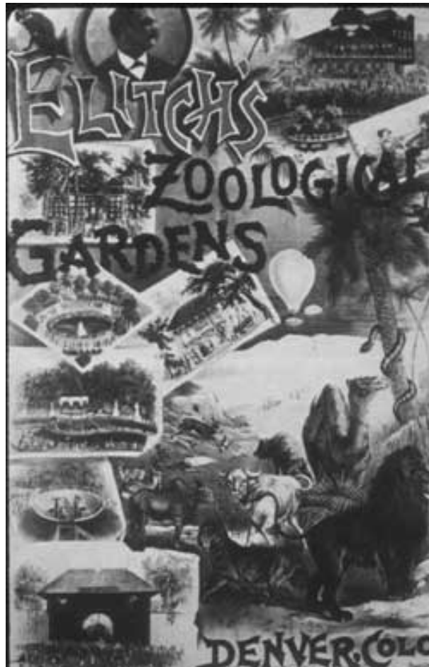
An early advertisement for the theater

Patty Duke, Edward G Robinson, Douglas Fairbanks, Vincent Price, Sarah Bernhardt, Grace Kelly, Hume Cronyn, Jessica Tandy, Raymond Burr, Darren McGaven, Cesar Romero, Barbara BelGeddes, Kitty Carlisle, Morey Amsterdam, Dick VanPatten, Gorge Goeble, Sid Caesar, Jose Ferrer, Steve Allen, Ginger Rogers, William Shatner, David McCallum, Tyrone Power, Nancy Walker