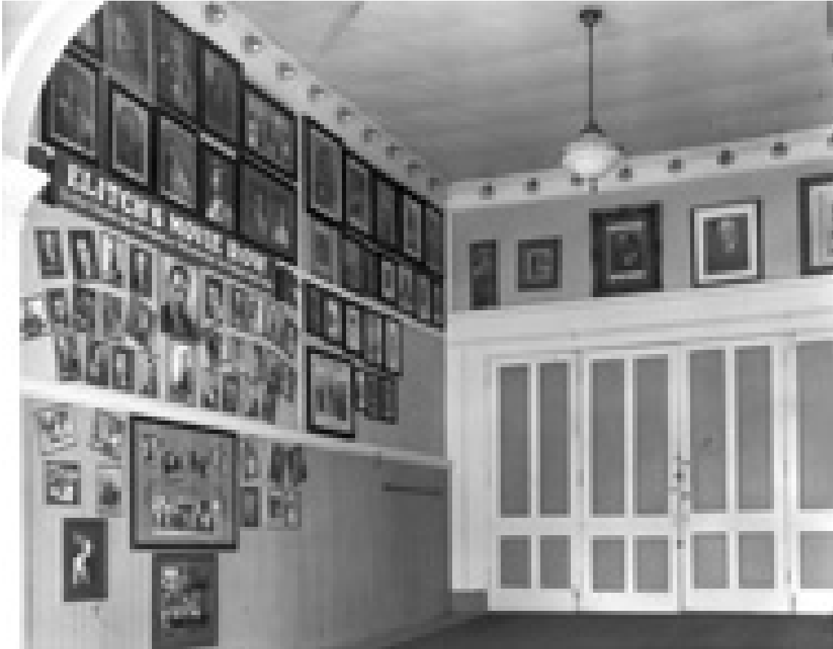
Entrance to the Theatre (unknown year)