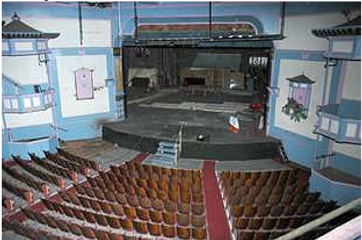
The stage during our investigation