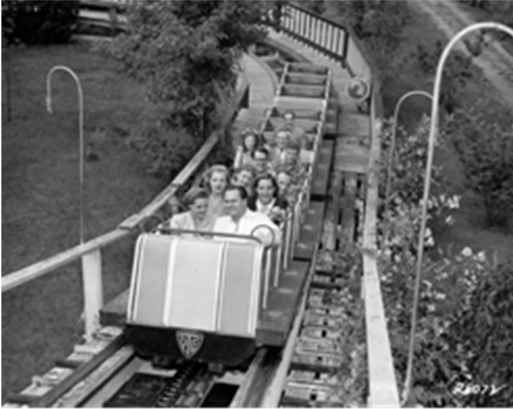
An early view of the Roller-Coaster

The Trocodero ballroom is torn down in 1975 due to the lack of popularity of dancing