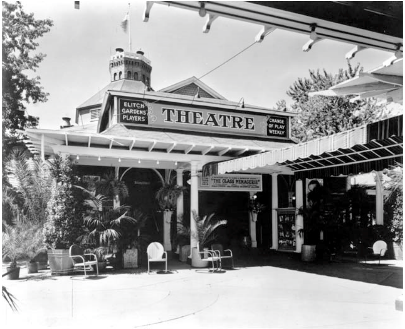
Outside the Theatre in the 1970's