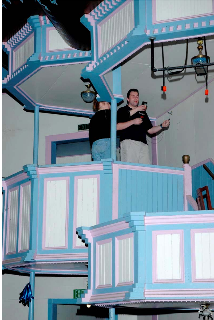
Mary's private box

EMF reading in Mary's box was elevated but consistent (caused by old wiring)