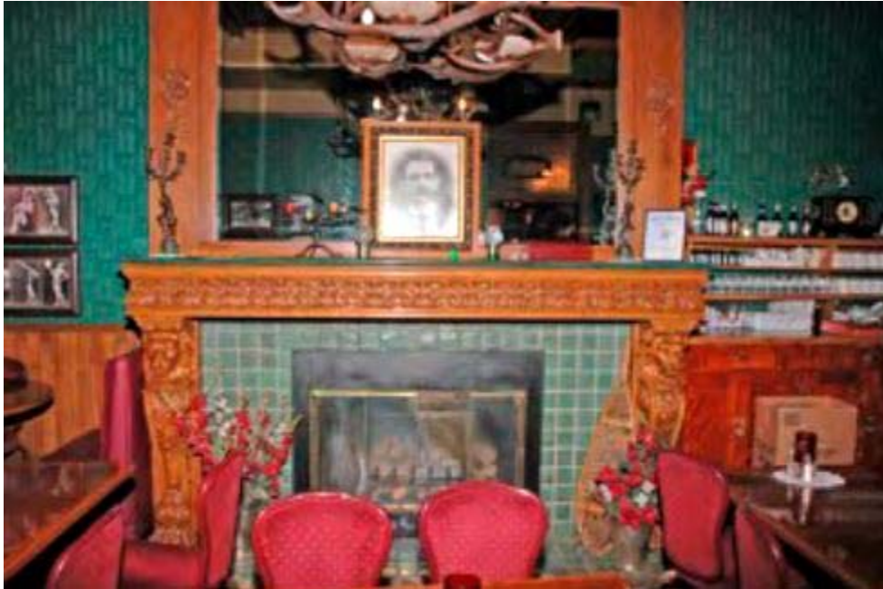
The fireplace in the Bar