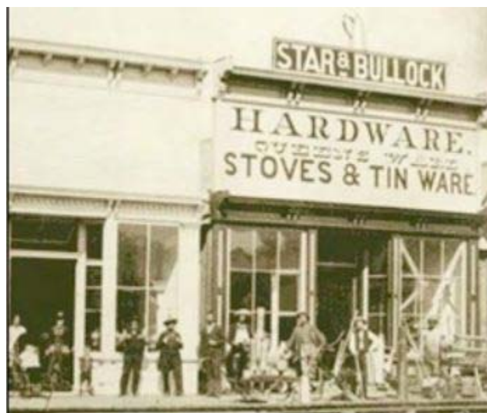
The Star & Bullock Hardware Store

Seth partnered with Solomon "Sol" Star to form the Star & Bullock Auctioneers and Commission Merchants. They set up shop in Helena, Montana.