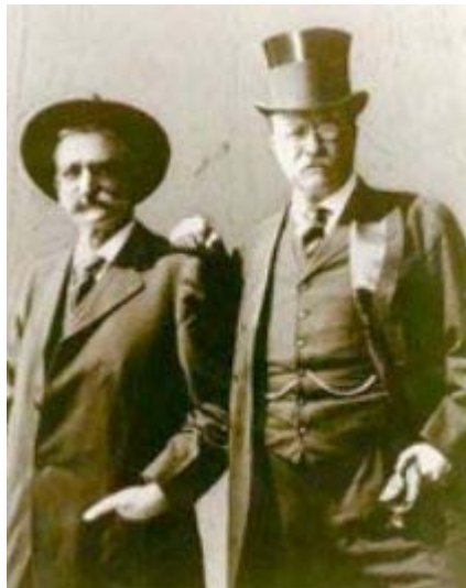
Seth and Theodore Roosevelt

Seth was invited to Mr. Roosevelt's inauguration in 1905; he took his group of cowboys to the event. Mr. Roosevelt then appointed Seth Bullock as the United States Marshal for South Dakota. Seth held the position for nine years.