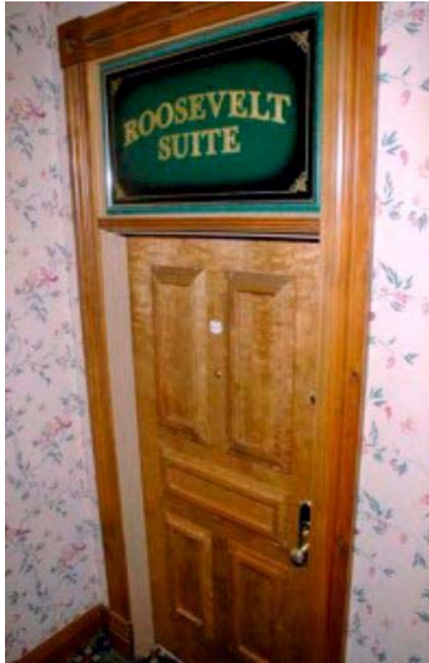
Entrance to the Roosevelt Suite