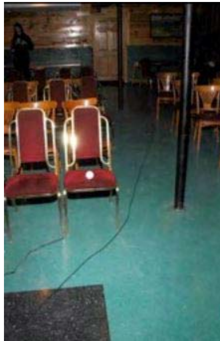
The ball that fell off of the chair

The Bullock suite has had reports of the Phantom clock that is said to ring on its own, there is a replica of the hat that Seth used to wear that is on the top of the entertainment center, some guests have reported that it has moved to other locations of the room and even claimed to see it float across the room.