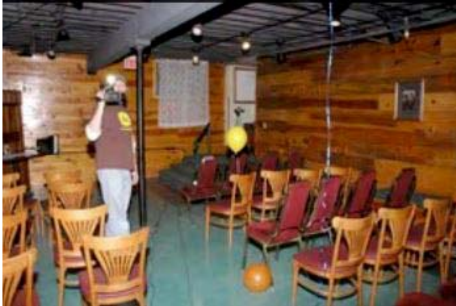
Balloons on the chairs to check for air current

For the duration of the investigation there were no significant events.