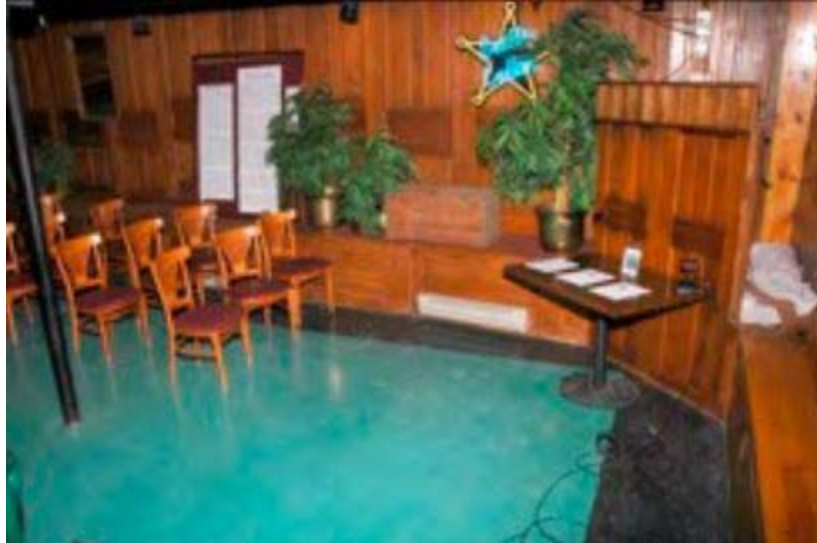
Basement area used for tours

At 8:21 the soft baseball that was located on a chair in the seating area of Seth's Cellar rolled up the chair and off of the front of the chair, ending up approximately six feet from the chair. When we place the ball back on the chair it would roll off of the back of the chair (the natural slope of the chair)