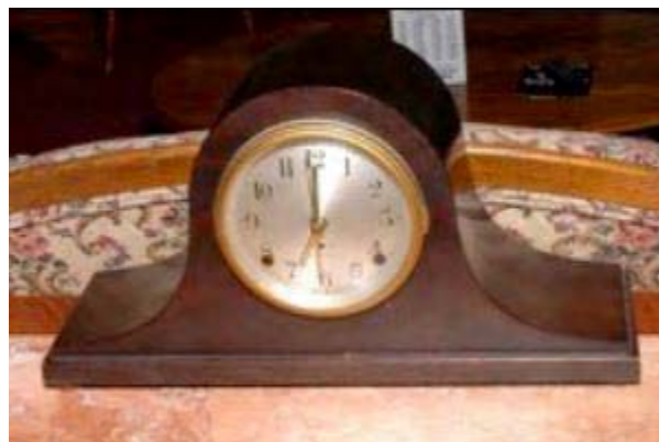
The Haunted Clock

The story of the clock is that when people are walking around in the room the bell of the clock will chime, and the clock no longer works.