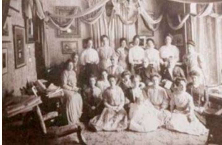
The “Ladies of the Bullock”

The ghost stories of the Bullock Hotel reflect the rich and colorful history of the location and its past residents. Some of the stories are based on facts while others have become more of the traditional urban legend style of story.