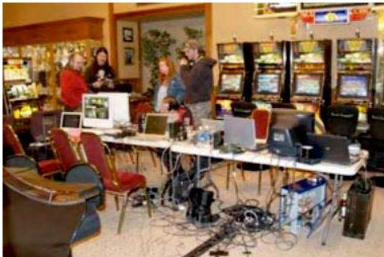
The Base location located in the main Casino

The team reconvened at 9:00 in the morning. We discussed the reported locations of activity with staff members and some of the guests of the Hotel. We also attended the Ghost Tour that highlighted some of the traditional stores and legends of the Hotel.