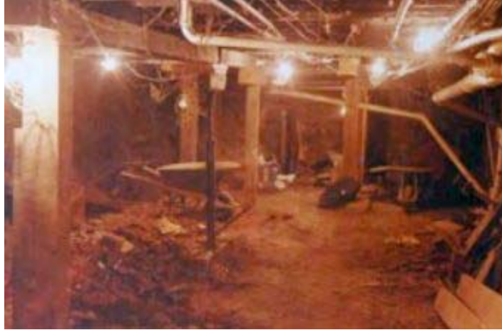
The Bar during renovations (1991)

A woman who had been given a visit to the hotel as a gift by her husband just before his death, decided to take the vacation as a way to remember her husband. She was staying in room 303 and one evening around 2:00 in the morning she went to the front desk to report that she had been awakened by someone sitting at the foot of her bed. She reported that he was a tall man with a hat. When she looked up she says that he “just vanished”, she refused to stay in the room and the staff had to get her belonging out of the room for her because she refused to go back into the room.