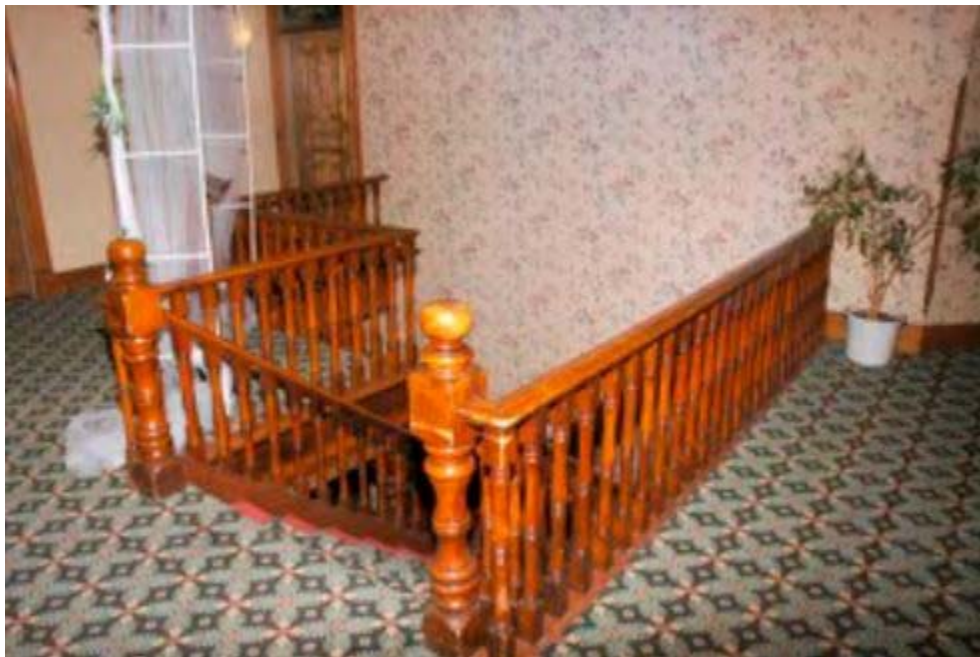
The top of the main staircase

The ghost stories of the Bullock Hotel reflect the rich and colorful history of the location and its past residents. Some of the stories are based on facts while others have become more of the traditional urban legend style of story.