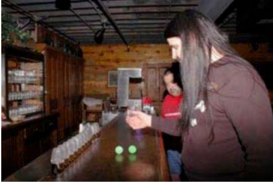
The bar where the ball rolled

A letter for a past guest, relates a story of a woman who was waiting for her husband to come back to the room, when she witnessed some paperwork “fly off of the television” and then felt what she thought was her husband sit next to her in the bed. When she turned to comment about the papers she discovered that she was the only one in the room.