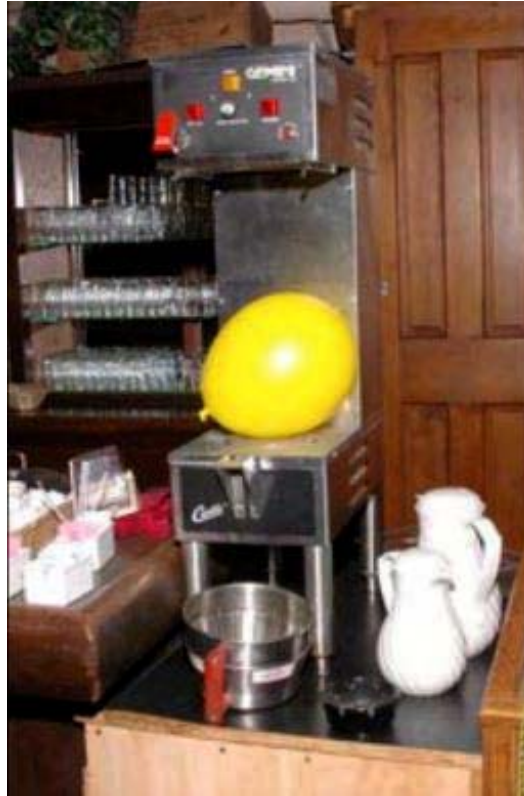
The coffee machine that turned on by itself

The team reconvened at 9:00 in the morning. We discussed the reported locations of activity with staff members and some of the guests of the Hotel. We also attended the Ghost Tour that highlighted some of the traditional stores and legends of the Hotel.