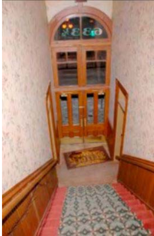
Top of the main stairs

205, 207, 208, 209, 211, 302, 303, 314, Bully's Bar and Seth's Cellar. All of them have had reports of appliances and lights working by themselves, the sounds of children when there are none present in the area.