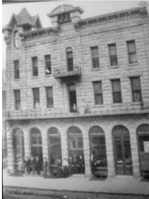
Early days of the Hotel