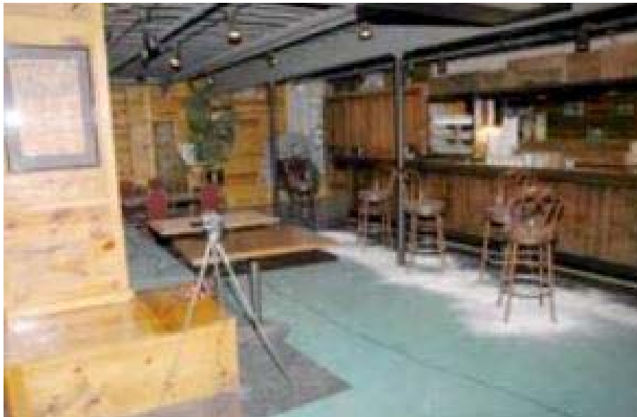
Cornstarch on the floor near the bar

One team member was walking back taking EMF readings, they said that they turned around to talk to the person that they had heard behind them and discovered that they were the only ones in the area.