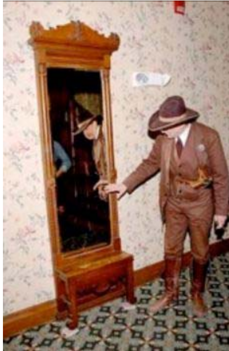
The Haunted Mirror at the top of the main staircase