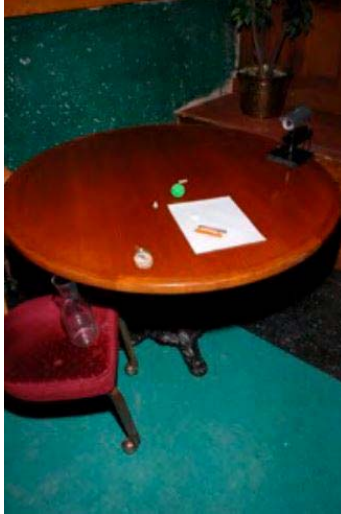
Ball on the table near the back of the basement