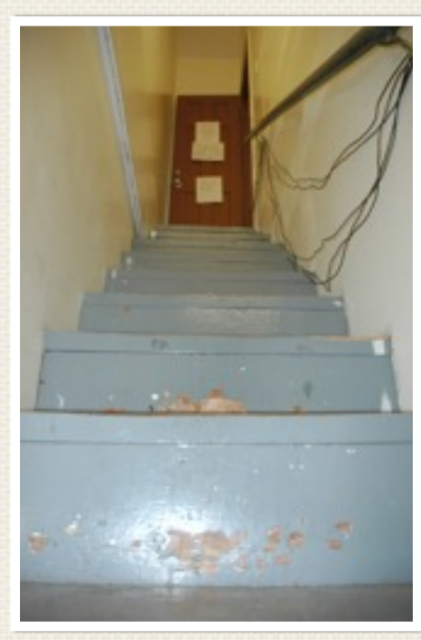
The stairs leading to the main floor