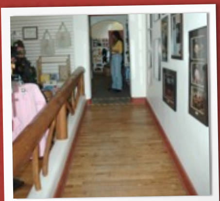
RAMP WHERE FOOTSTEPS WERE HEARD

We started the investigation by researching the history of the property and collecting the current reports of paranormal activity