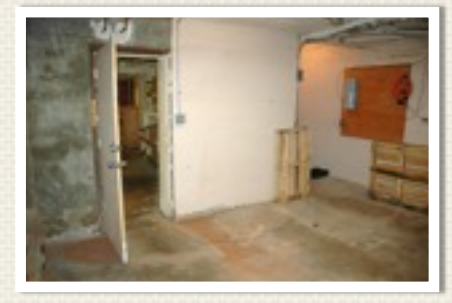
Back storage area in basement

While setting up the equipment we mapped out the area and took baseline readings for both natural and manmade Electro-magnetic fields. It was determined that there are areas with