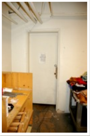
The door with broken handle

No unusual sound were monitored during the investigation.