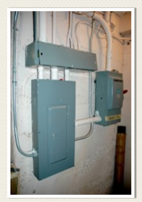
The main electrical panel

Sacred Stones Colorado's Red Rocks Park & Amphitheater. By Thomas Noel