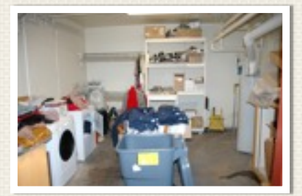
Basement Laundry room

We decided to look into the geology of the area to determine the possibility of any seismic activity that could cause a potential low frequency that could influence the people at the Trading Post. The report from the N.C.R.S. - U.S.G.S. concluded that while the area has an amazing array of unique features it has nothing that would seem to promote a cause for perceived paranormal activity.